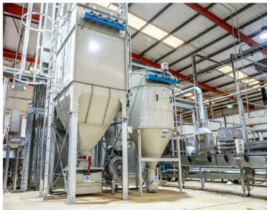
Dustcheck Maxi 328 & Compact 120 Dry Dust Collectors

Choosing the right dust control equipment requires expertise, knowledge and experience due to the multiple design considerations for each individual application and varying characteristics of dusts that needs to be captured. Dustcheck has been providing dust control and air filtration equipment for more than 40 years and as such is perfectly positioned to specify the most appropriate solution to the dust control requirements of its clients.