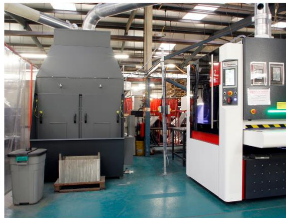
Dustcheck Nonflam Wet Dust Collector